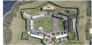
Crosshaven to Spike Island Tour