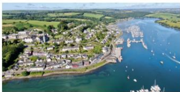
Crosshaven Harbour Tour