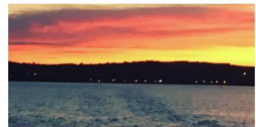
Sunset Cruise from Crosshaven