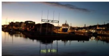
Sunset Cruise from Cork City