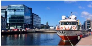
Cork City 2hr Scenic Harbour Tour