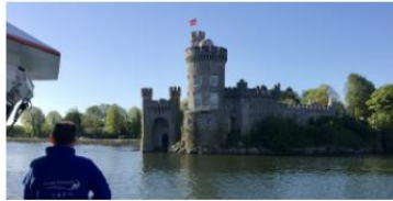
Cork City Mini After Lunch Cruise